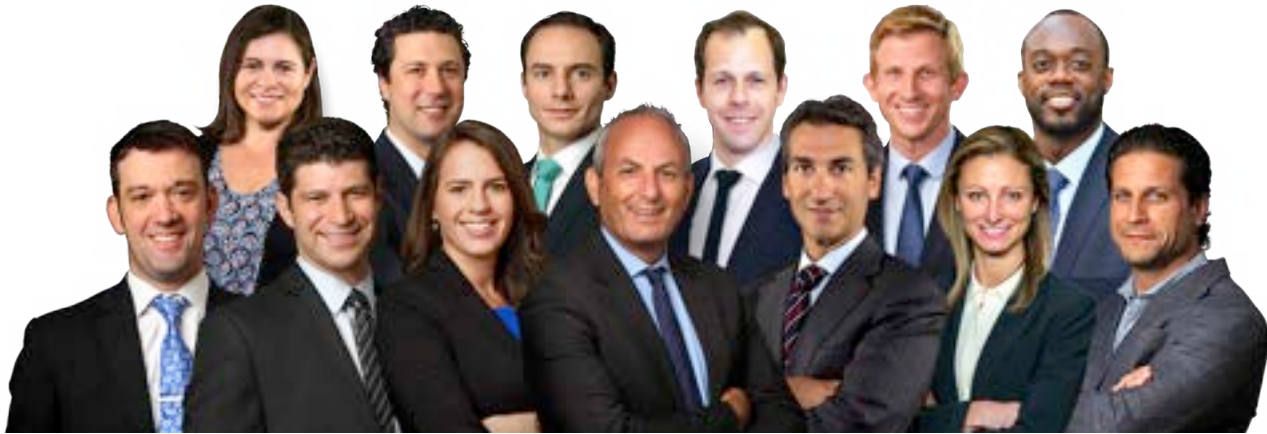
Attending faculty of the Columbia University Division of Shoulder, Elbow, & Sports Medicine

The Shoulder & Elbow Fellowship is recognized as a non-ACGME ASES-accredited fellowship, and the fellow is credentialed as an NYP attending, capable of operating independently within the NYP/Columbia hospital system. It is expected that the Shoulder & Elbow Fellow will cover the Vanderbilt Shoulder Clinic and schedule operative cases to be performed alone as the primary surgeon depending on case complexity. This credentialing will include malpractice insurance, fringe benefits, and expense coverage for appropriate licensure. The Shoulder & Elbow Fellow will be expected to bill as an Assistant Surgeon when applicable, or as Primary Surgeon when appropriate. It is expected that the fellow perform the clinical duties of an Attending Orthopedic Surgeon: providing clinical care for patients in the outpatient clinic and hospital settings, including rounding, documentation, and resident & student teaching. The Shoulder & Elbow Fellow will be considered an integral team member of the primary faculty's private practice.