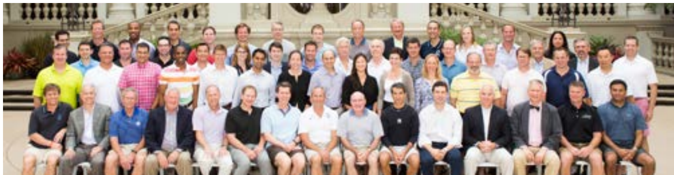
Members of the Columbia Shoulder Society at the 2013 Biennial Meeting