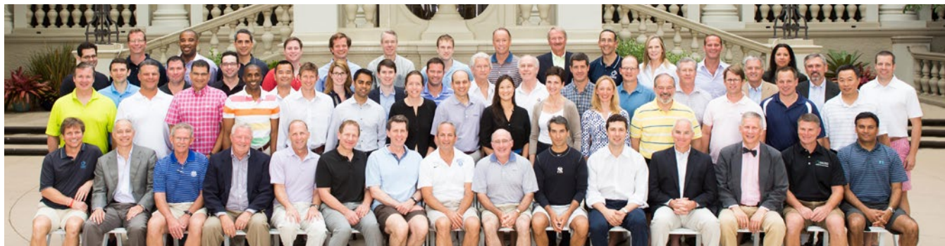
Members of the Columbia Shoulder Society at the 2013 Biennial Meeting