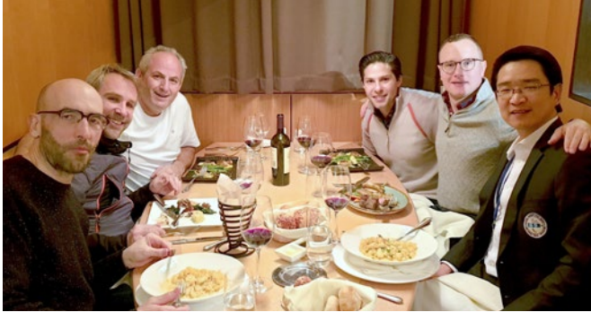
2019-2020 Shoulder and Sports Fellows at 2 nd Annual ASAP Meeting