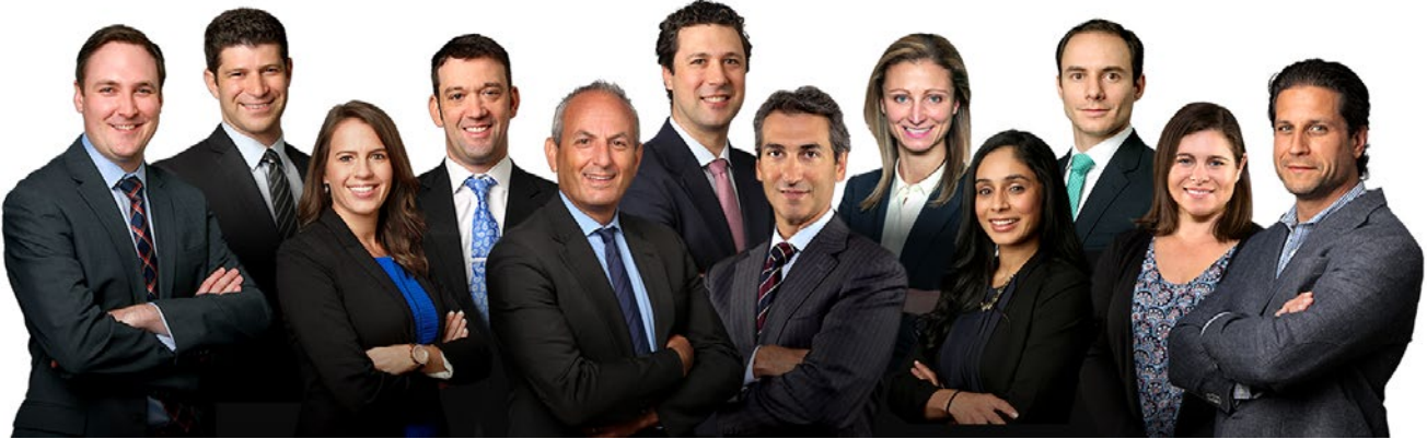
Attending faculty of the Columbia University Division of Shoulder, Elbow, & Sports Medicine

The Shoulder & Elbow Fellowship is recognized as a non-ACGME ASES-accredited fellowship, and the fellow is credentialed as an NYP attending, capable of operating independently within the NYP/Columbia hospital system. It is expected that the Shoulder & Elbow Fellow will cover the Vanderbilt Shoulder Clinic and schedule operative cases to be performed alone as the primary surgeon depending on case complexity. This credentialing will include malpractice insurance, fringe benefits, and expense coverage for appropriate licensure. The Shoulder & Elbow Fellow will be expected to bill as an Assistant Surgeon when applicable, or as Primary Surgeon when appropriate. It is expected that the fellow perform the clinical duties of an Attending Orthopedic Surgeon: providing clinical care for patients in the outpatient clinic and hospital settings, including rounding, documentation, and resident & student teaching. The Shoulder & Elbow Fellow will be considered an integral team member of the primary faculty's private practice.